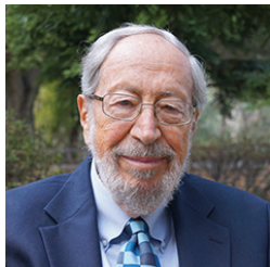
Prof. Edgar Schein The Organizational Culture and Leadership Institute (Presenting Virtually)